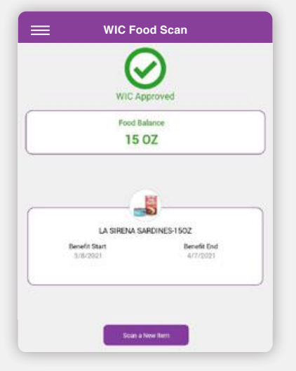
WIC approved foods in your family benefits.

Scan the product barcode. You will see one of the screens below.